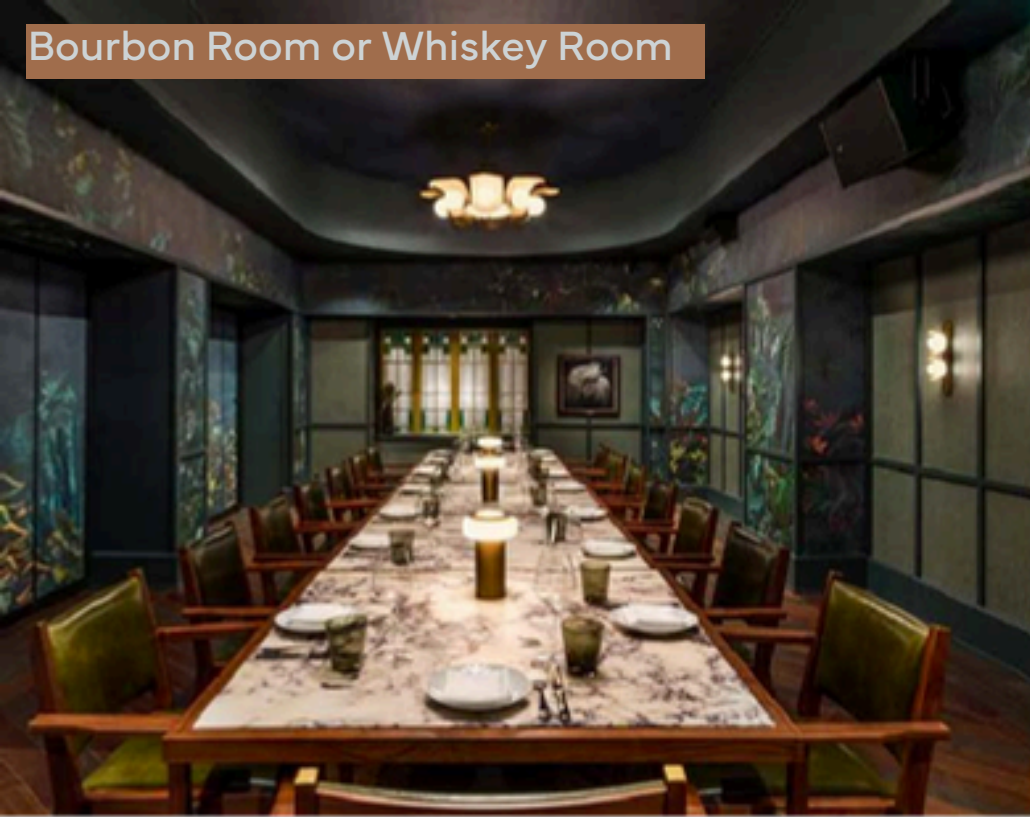
Bourbon Room or Whiskey Room